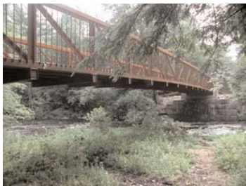
This bridge now connects the MCRT from Oakdale, MA to River Street in Holden, MA. The new Charlotte Kaplan bridge installed June 20, 2002.

Wachusett Greenways is a grass roots team of volunteers working to expand a network of trails and open spaces linking our communities. We regularly meet to build and maintain trails, improve open spaces, and reach out to the six towns we serve to promote sustainable and environmentally-sensitive use of green spaces. We envision an expanded network of trails and