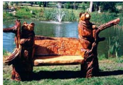
No two pieces are the same, and each piece is signed and dated by the artist.

Most of the carvings in our Gallery were carved from white pine and cedar logs, as this is the common local wood. We also sometimes use red cedar from British Columbia when available and other woods. Each piece is carved with a chainsaw, while some finishing work is accomplished using a small rotary tool.